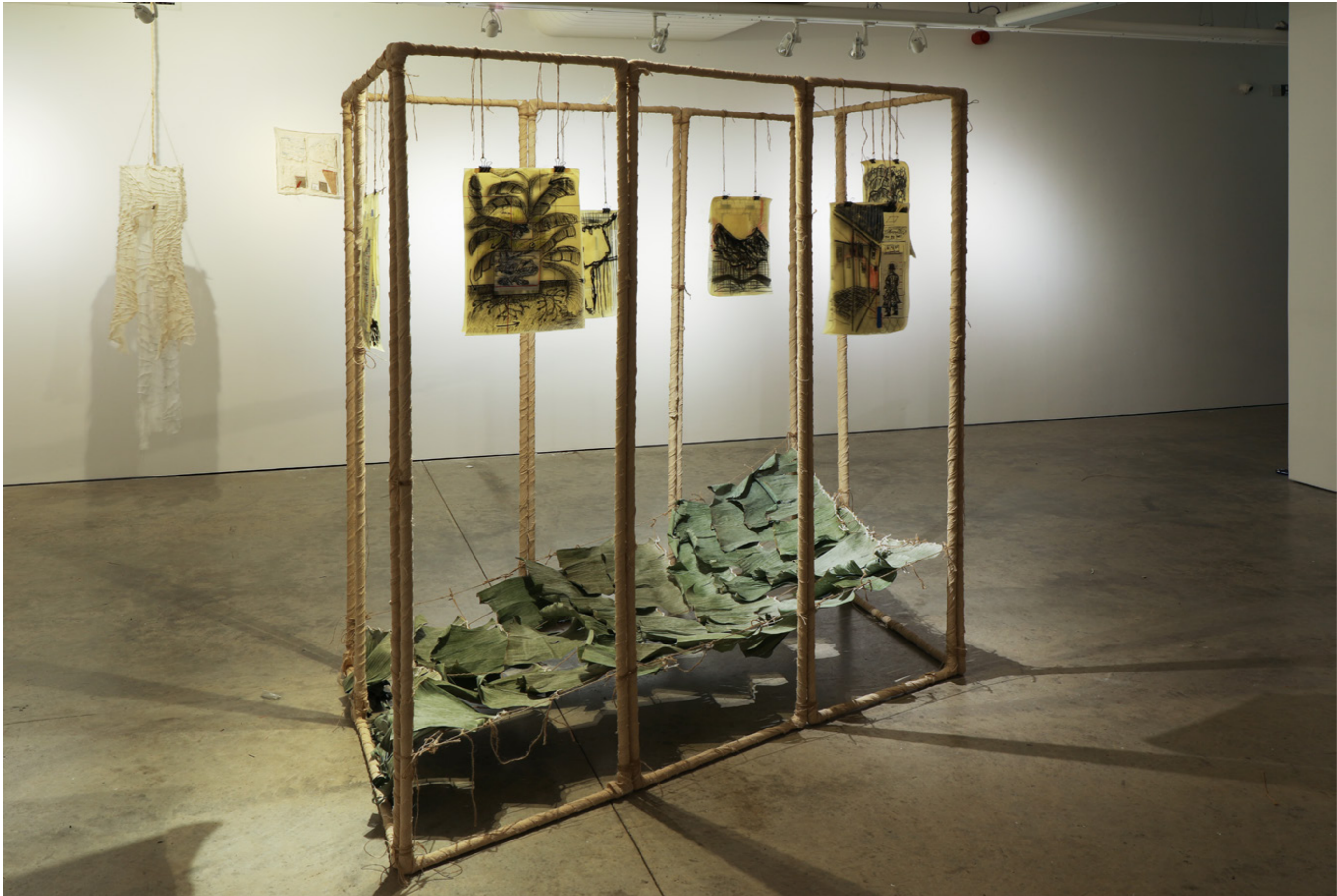
Courtyard of Forgotten Memories. 2022 Banana leaves, PCL plastic, cotton twill fabric, rope, sketch paper (...) Forgot to Remember to Forget (...), 2022, Gerald Moore Gallery, London