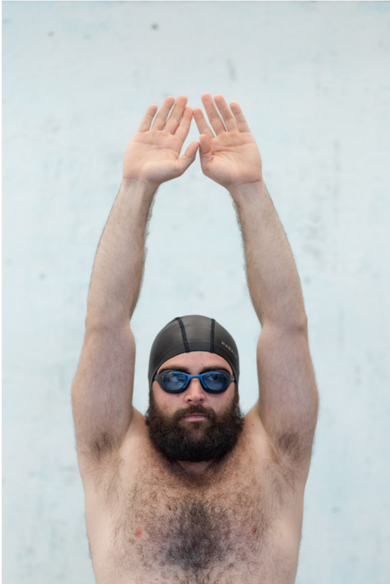
Why Do Swimmers Suddenly Appear. 2023 Performance and Installation Degree Show, 2023, at Central Saint Martins, London.