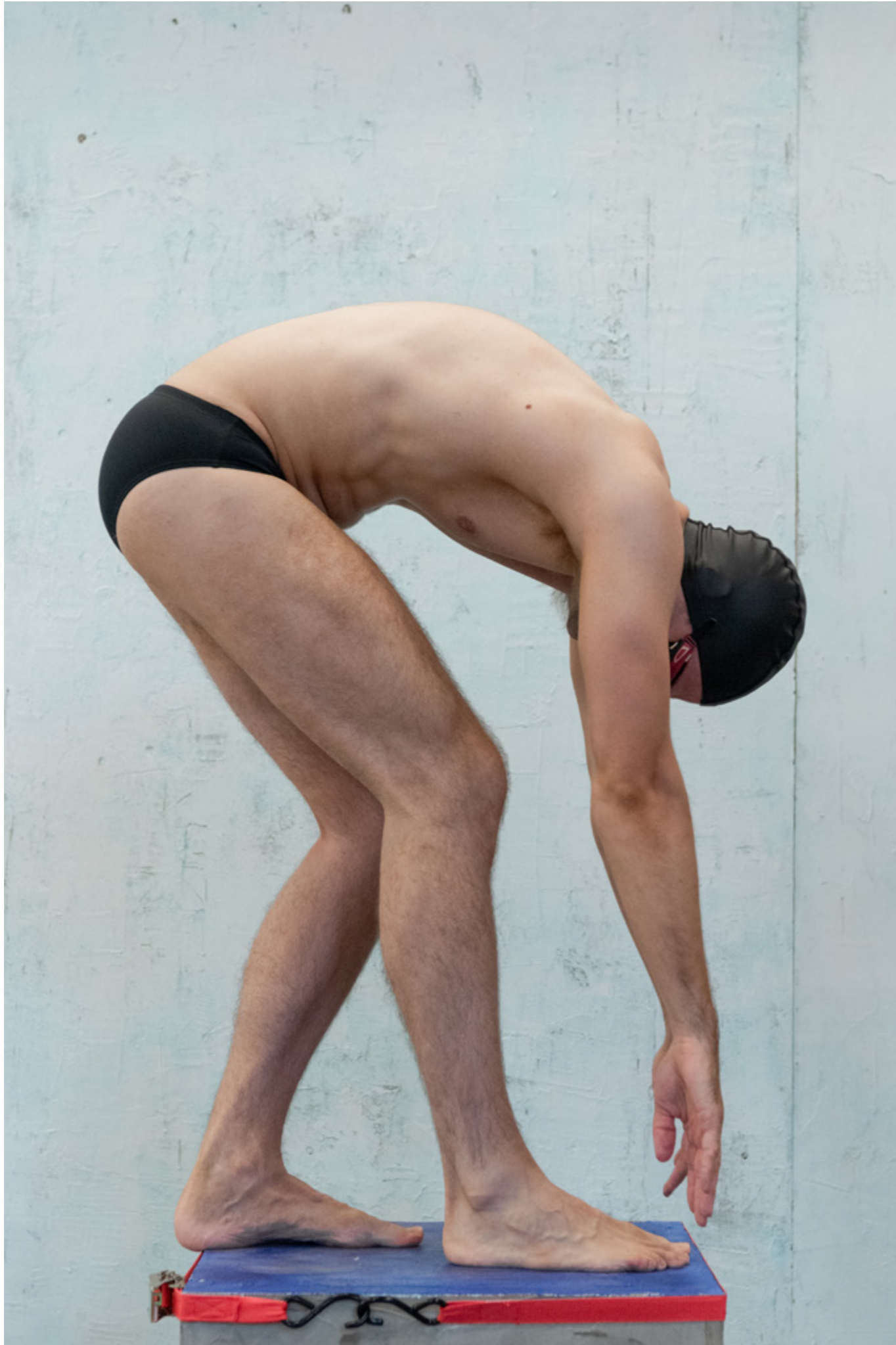
Why Do Swimmers Suddenly Appear. 2023 Performance and Installation Degree Show, 2023, at Central Saint Martins, London.