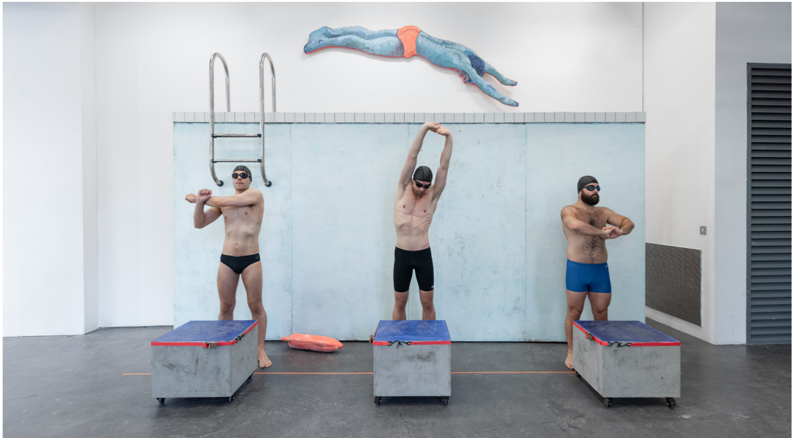
Why Do Swimmers Suddenly Appear. 2023 Performance and Installation Degree Show, 2023, at Central Saint Martins, London.