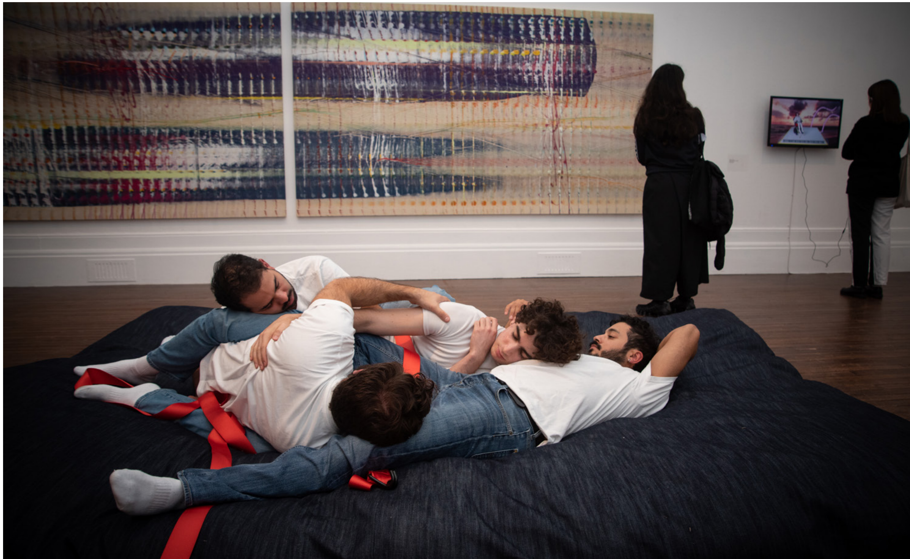
Collective Cuddles. 2023 Performance and Installation. Bloomberg New Contemporaries at Grundy Art Gallery, 2023.