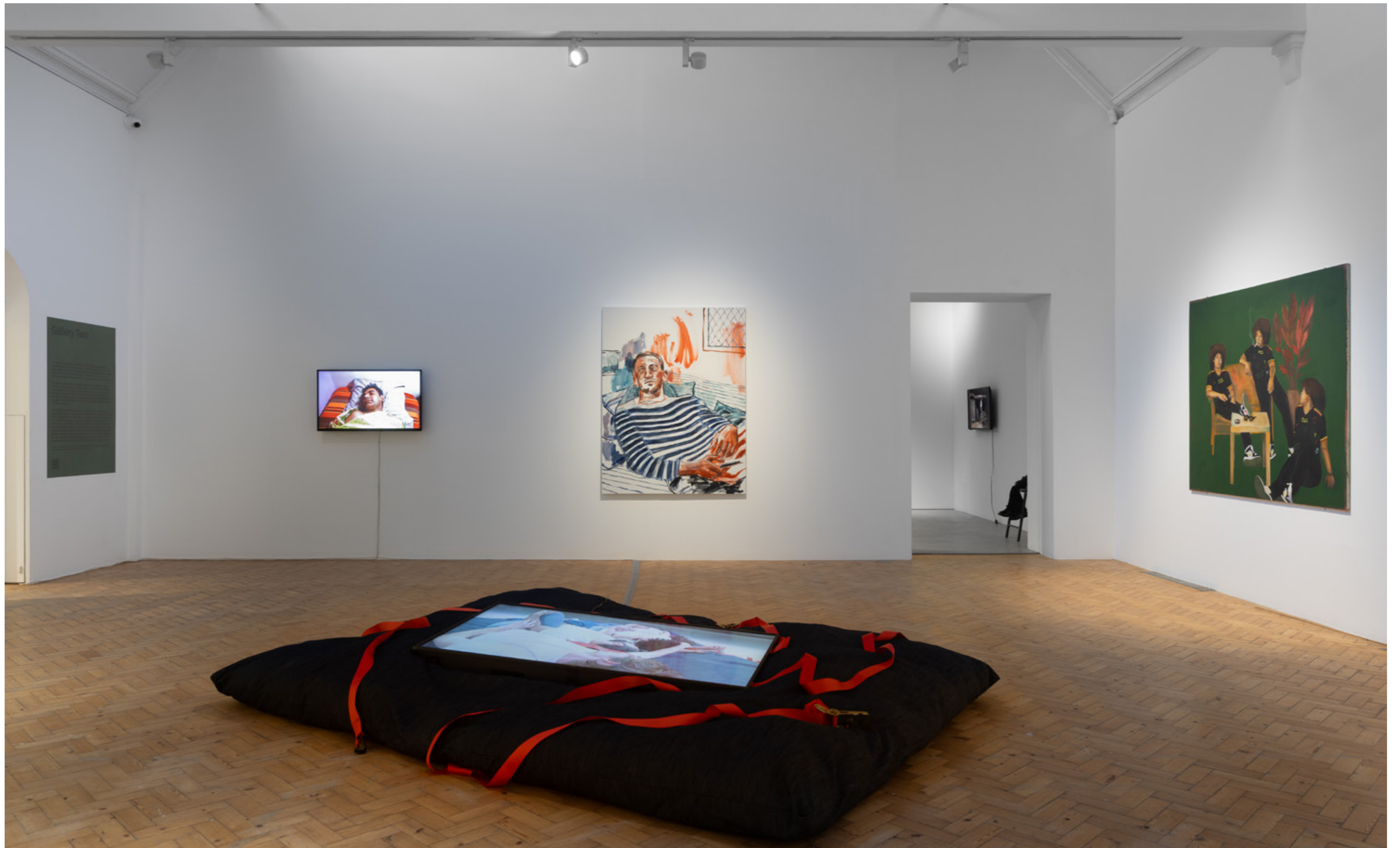
Collective Cuddles. 2023 Performance and Installation, 40 x 300 x 200 cm. 4 min. 26 sec. Bloomberg New Contemporaries at Camden Art Centre, 2024.