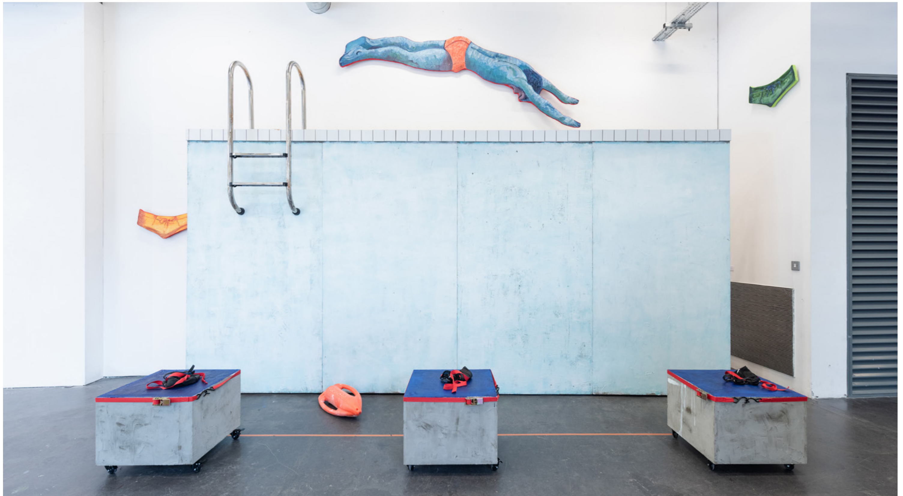
Why Do Swimmers Suddenly Appear. 2023 Performance and Installation Degree Show, 2023, at Central Saint Martins, London.