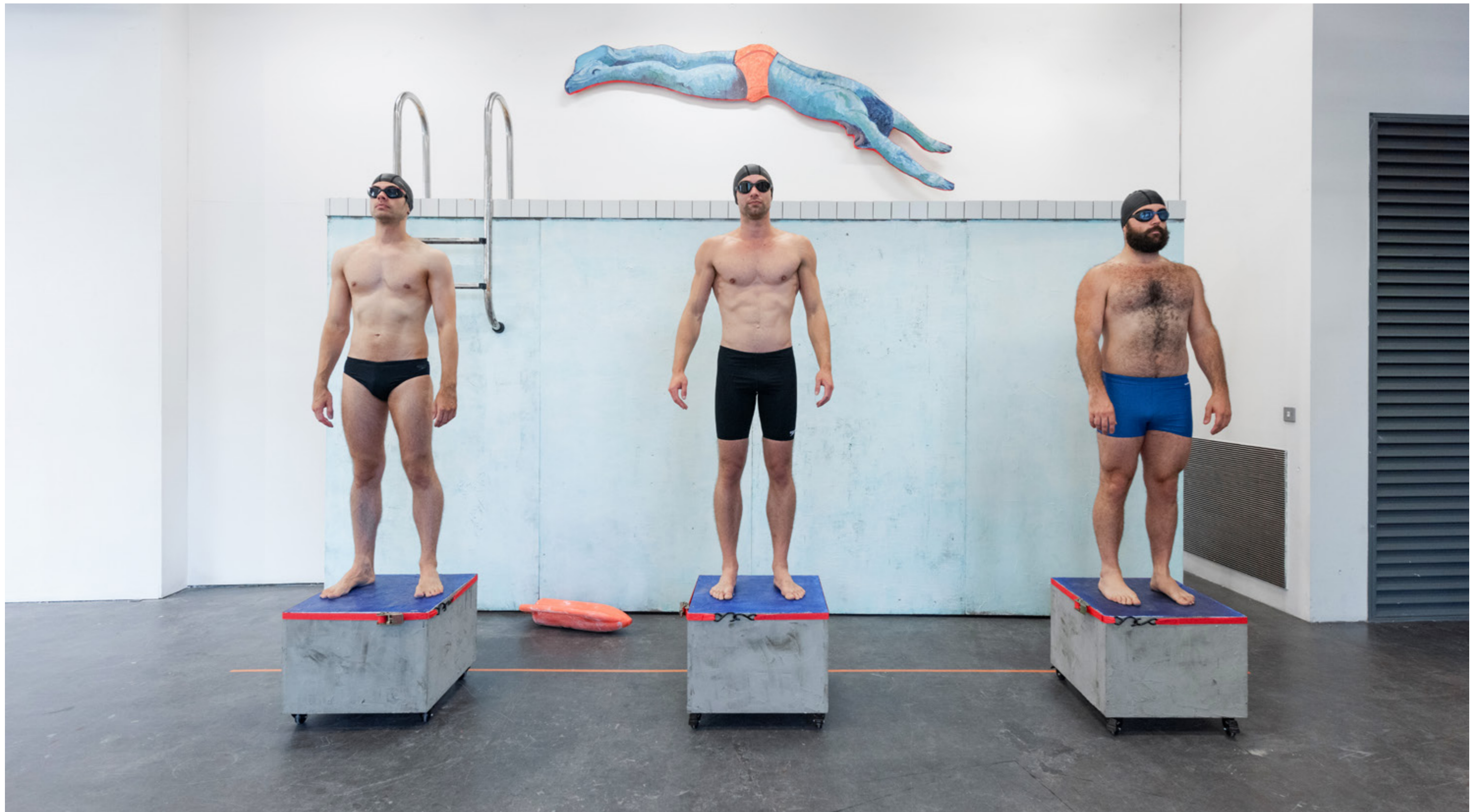
Why Do Swimmers Suddenly Appear. 2023 Performance and Installation Degree Show, 2023, at Central Saint Martins, London.