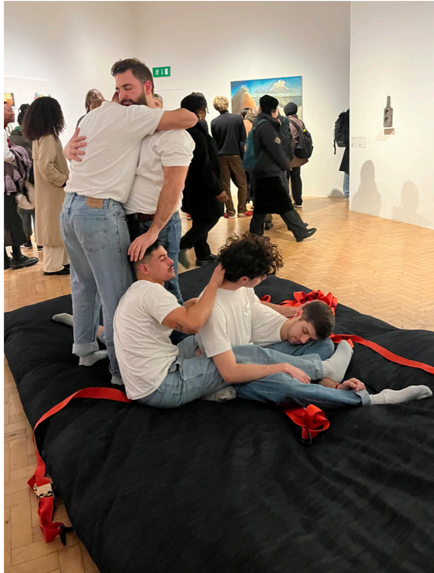
Collective Cuddles. 2023 Performance and Installation Bloomberg New Contemporaries at Camden Art Centre, 2024.