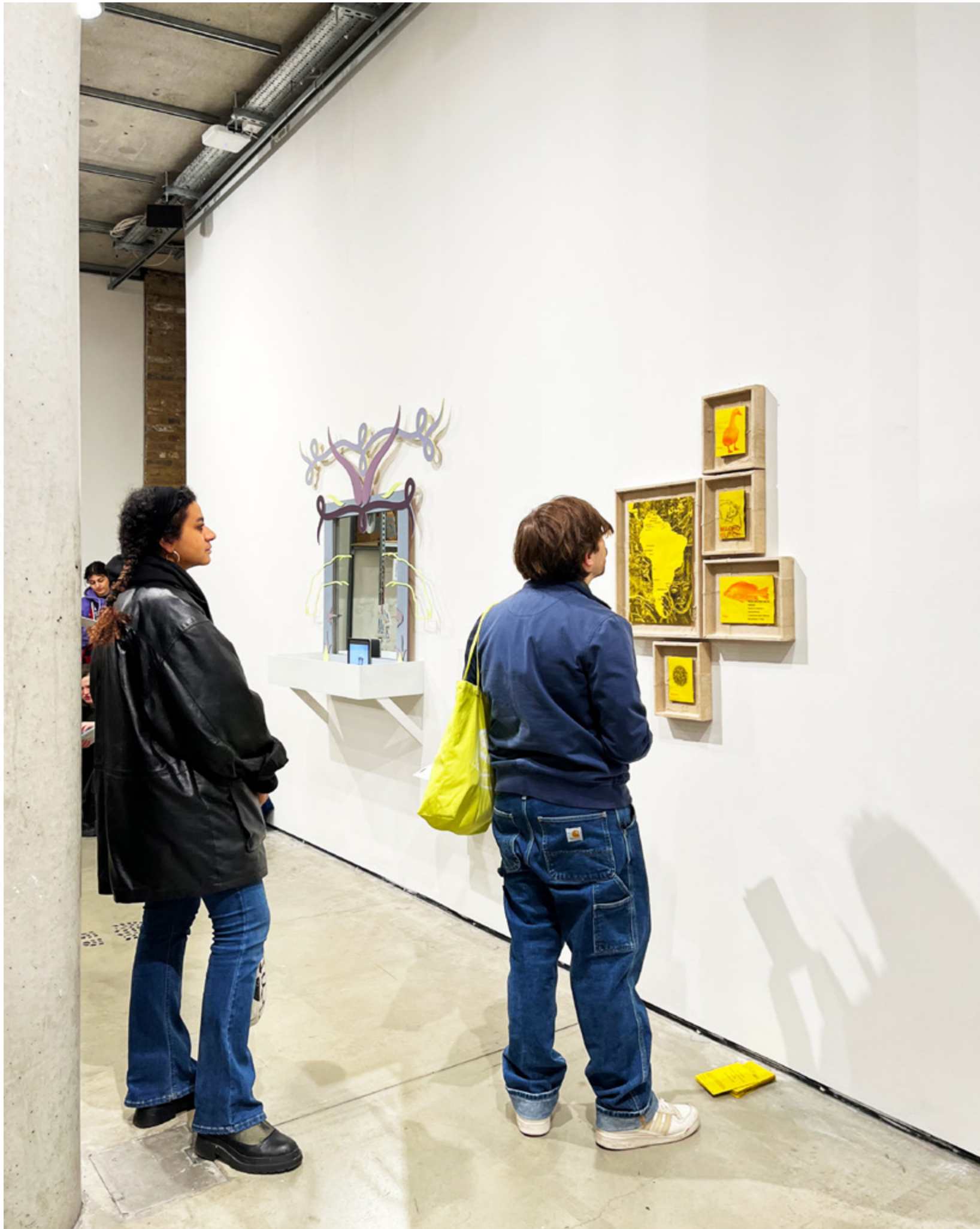
Macho Glitch , 2023 Riso Print on paper, on artist's frame. View of the exhibition, 2023, at Lethaby Gallery, London.