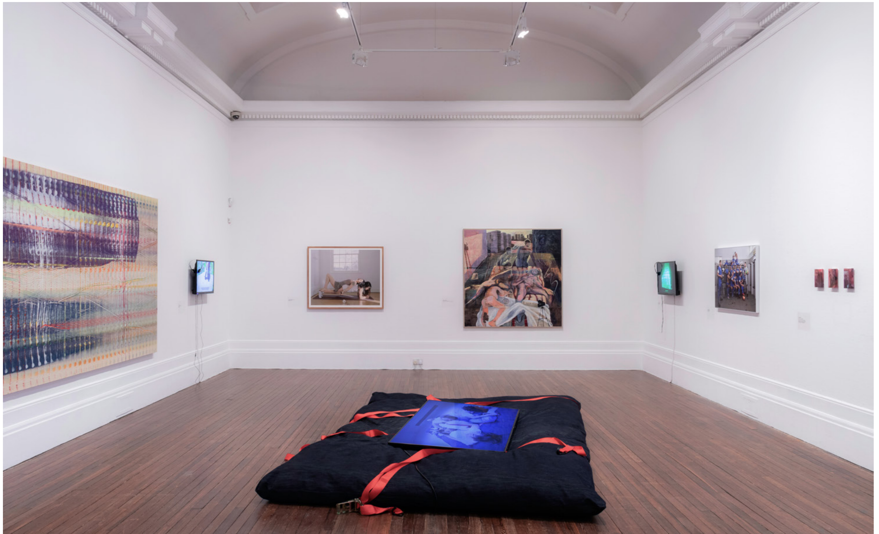
Collective Cuddles. 2023 Performance and Installation. Bloomberg New Contemporaries at Grundy Art Gallery, 2023.