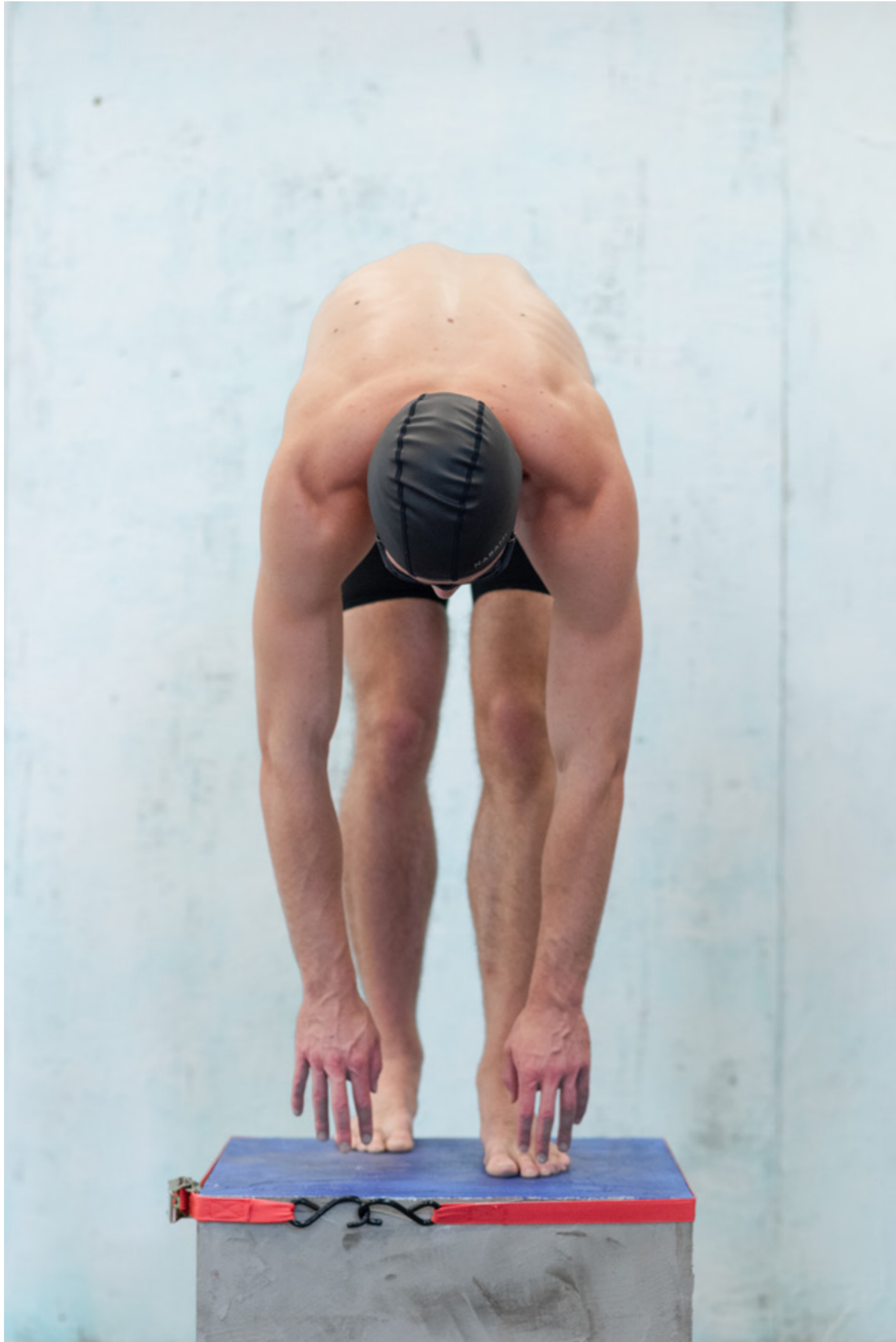
Why Do Swimmers Suddenly Appear. 2023 Performance and Installation Degree Show, 2023, at Central Saint Martins, London.