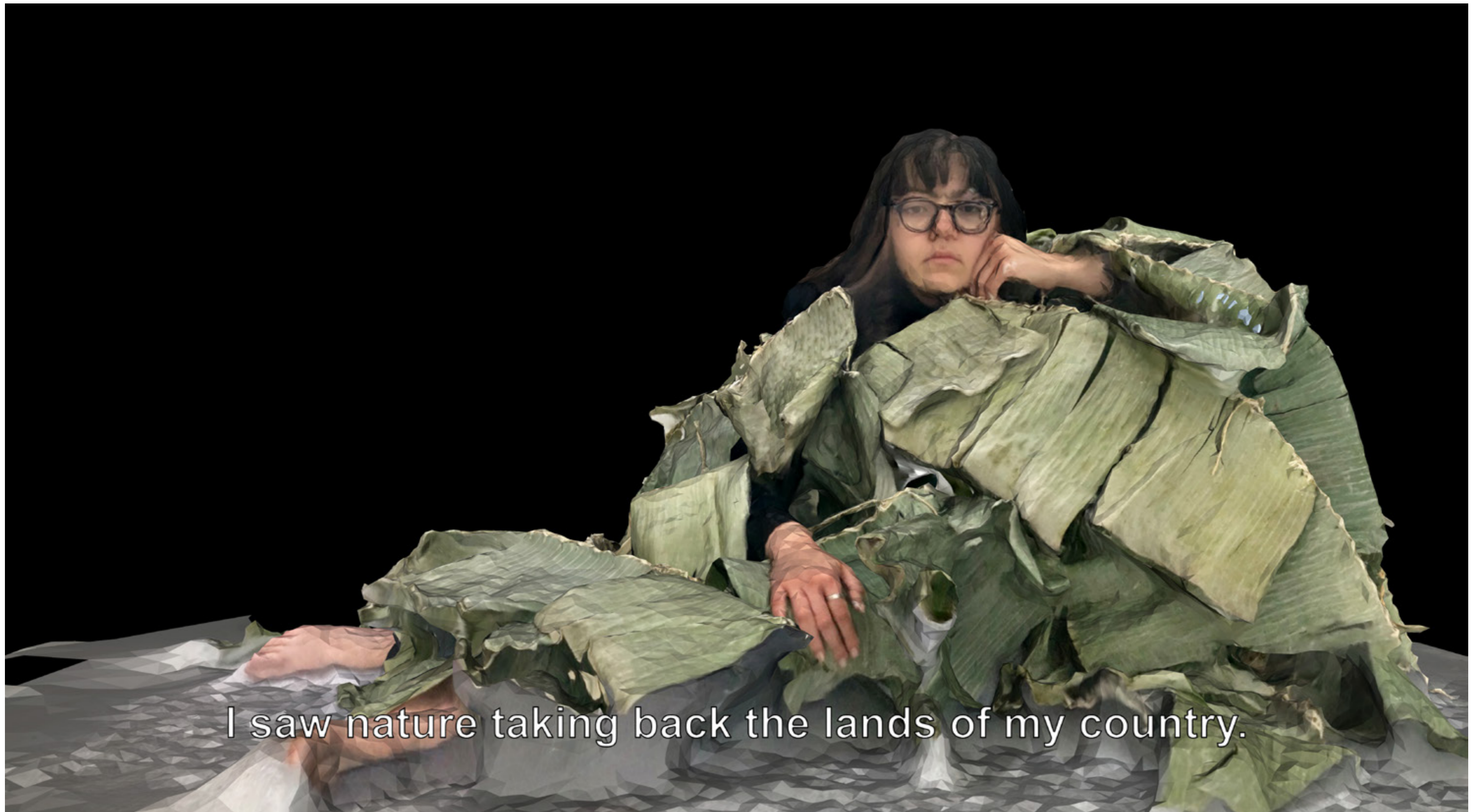
Citizen of a Nation Swallowed by The Sea. 2023 Video 1 min. 59 sec. Work awarded the LVMH Maison/0 The Earth Award 2023