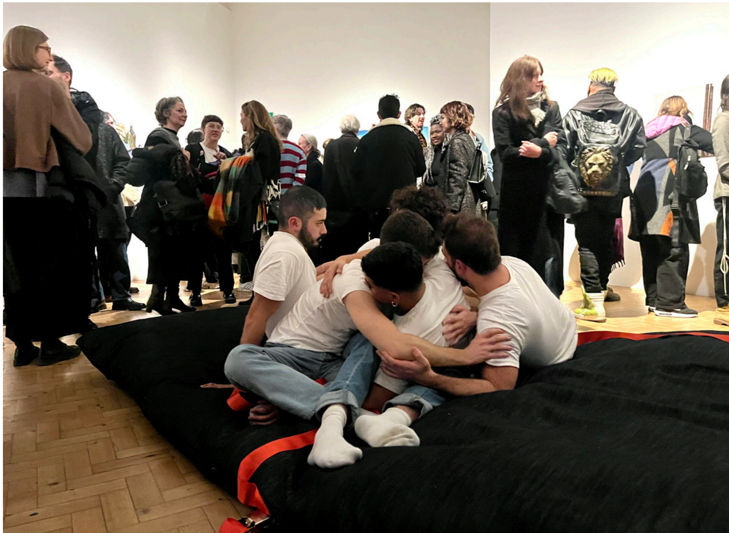
Collective Cuddles. 2023 Performance and Installation Bloomberg New Contemporaries at Camden Art Centre, 2024.