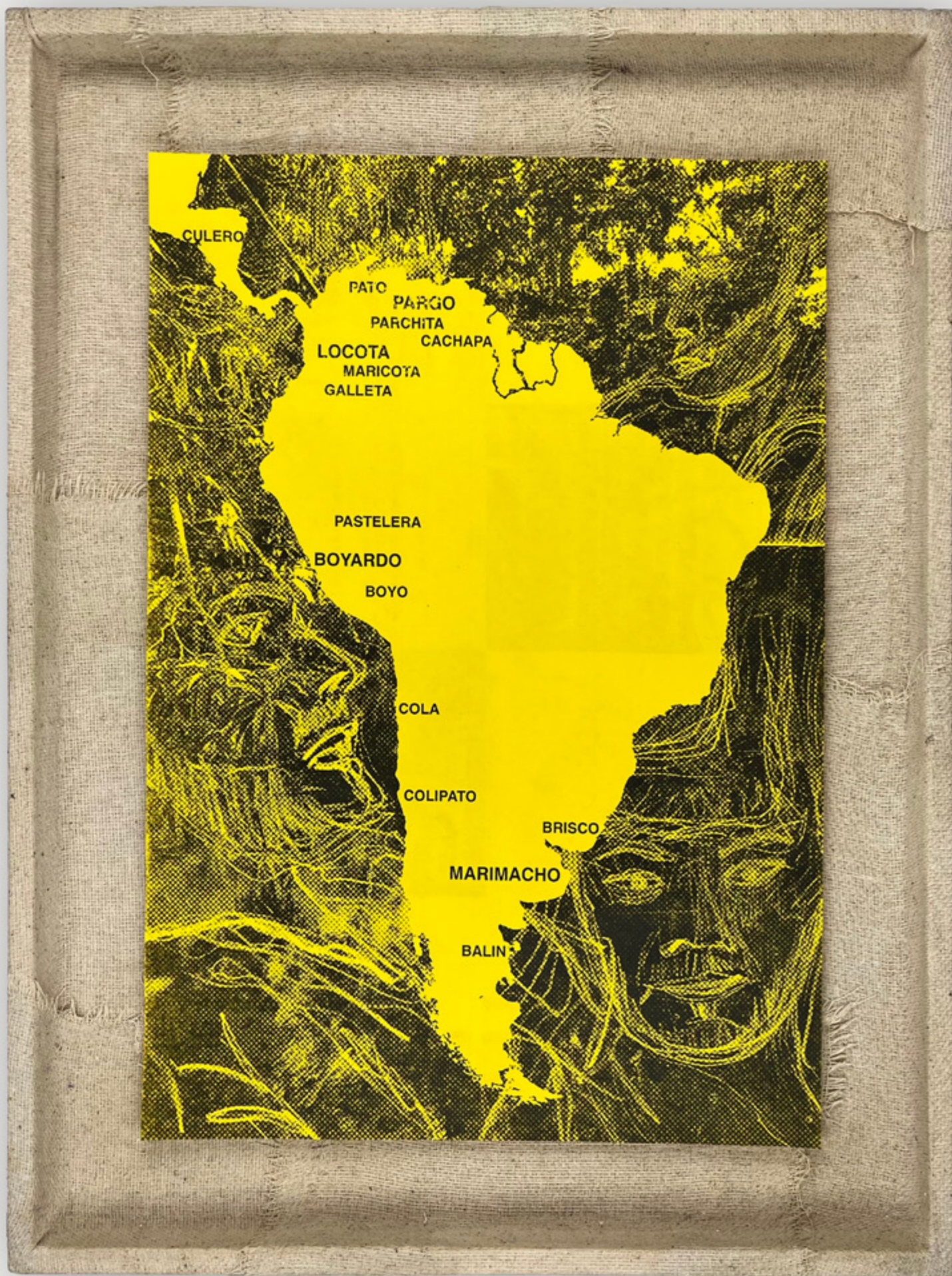
Macho Glitch (Continente) , 2023 Riso Print on paper, on artist's frame. Edition of 5. 50 x 38 cm.