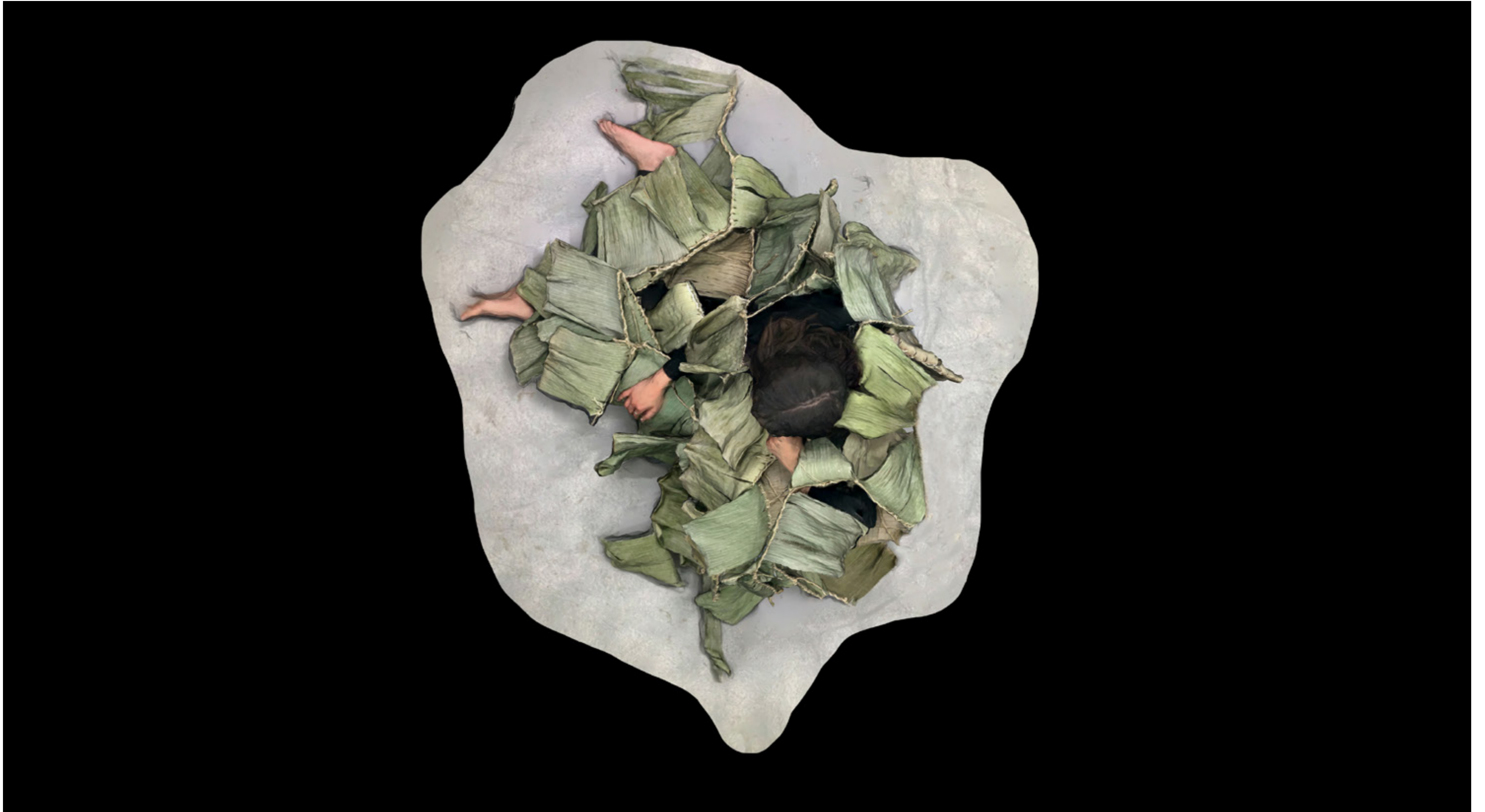
Citizen of a Nation Swallowed by The Sea. 2023 Video 1 min. 59 sec. Work awarded the LVMH Maison/0 The Earth Award 2023