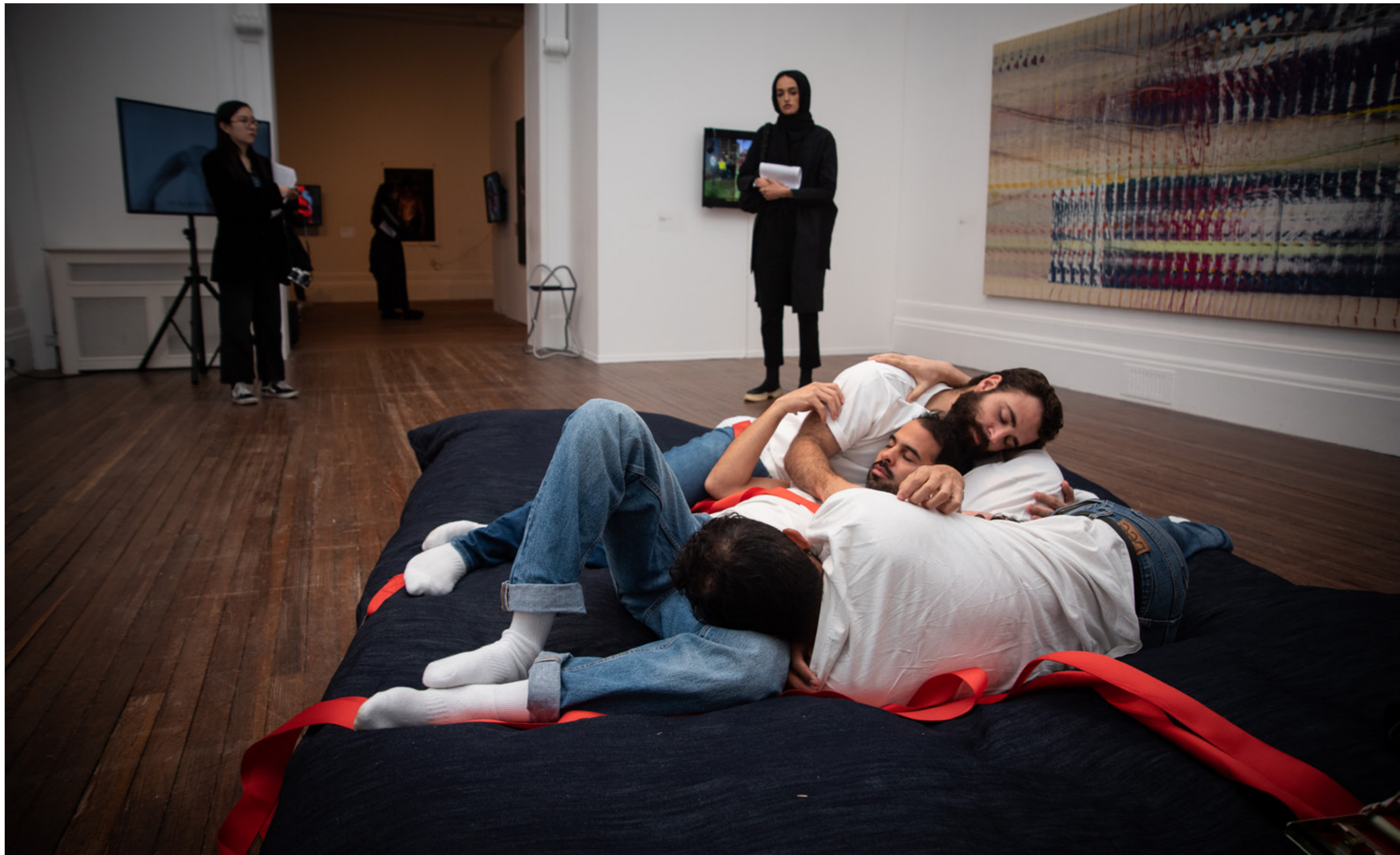
Collective Cuddles. 2023 Performance and Installation. Bloomberg New Contemporaries at Grundy Art Gallery, 2023.