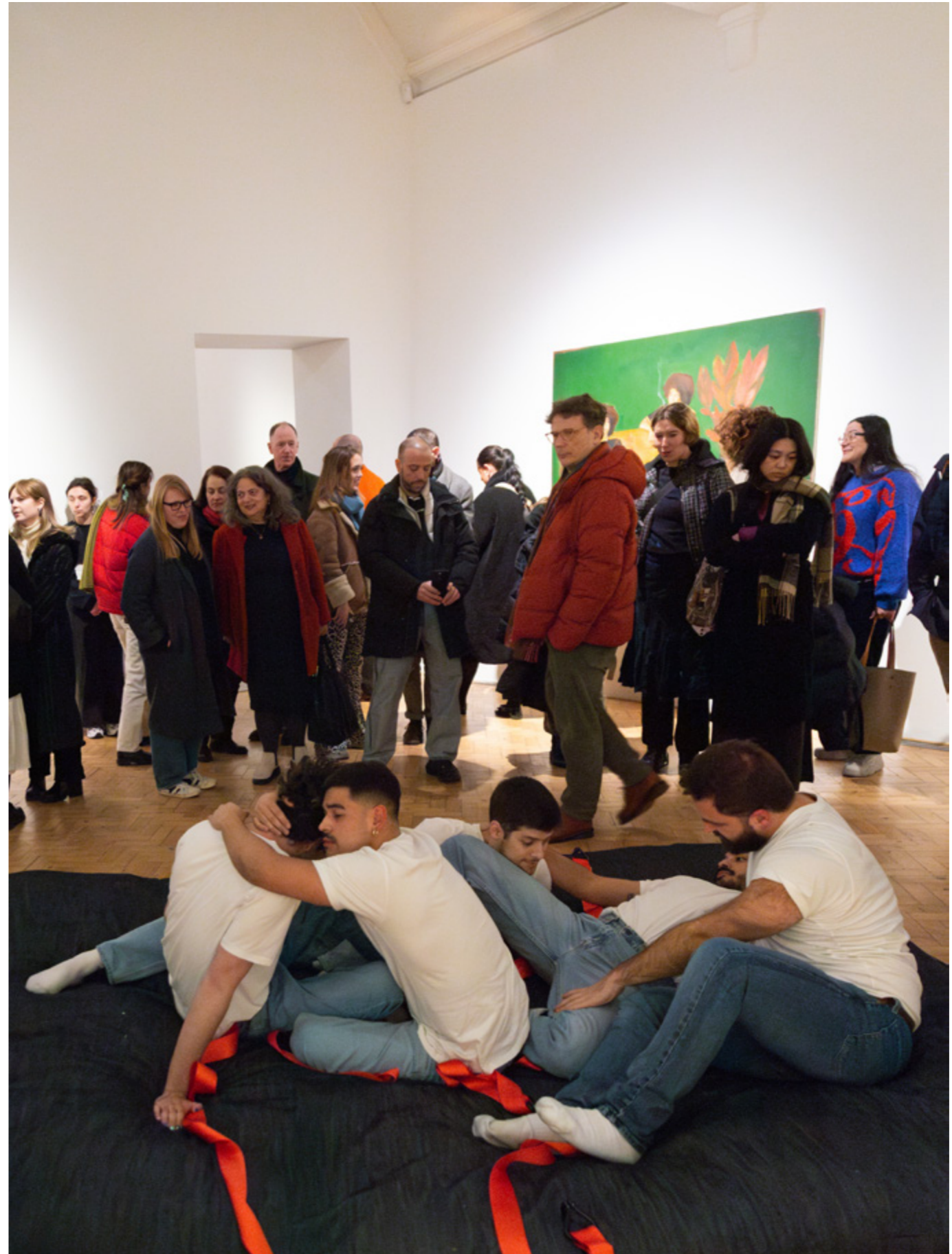
Collective Cuddles. 2023 Performance and Installation Bloomberg New Contemporaries at Camden Art Centre, 2024.