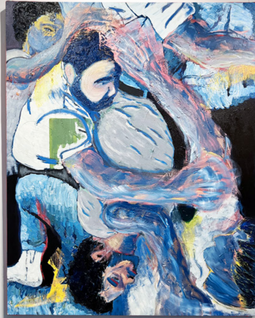
What Time Leads The Willing Body To Do. 2023 Oil and Wood Glue on canvas. 180 x 144 cm View of the exhibition, 2023, at The Koppel Project, London.