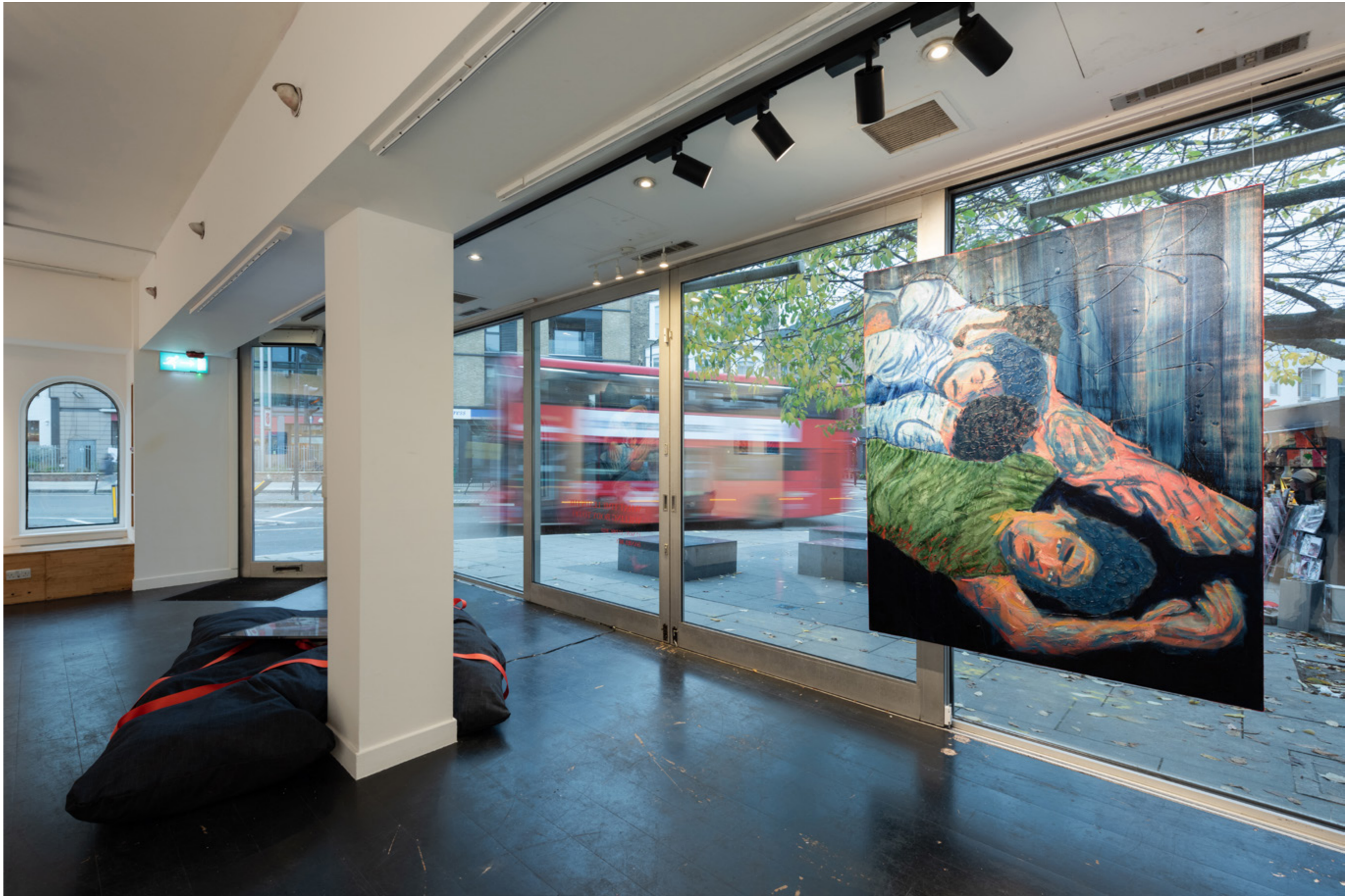
Our Bodies Are Given To Us Only Once. 2023 Oil and Wood Glue on canvas. 180 x 140 cm View of the exhibition, 2023, at The Koppel Project, London.