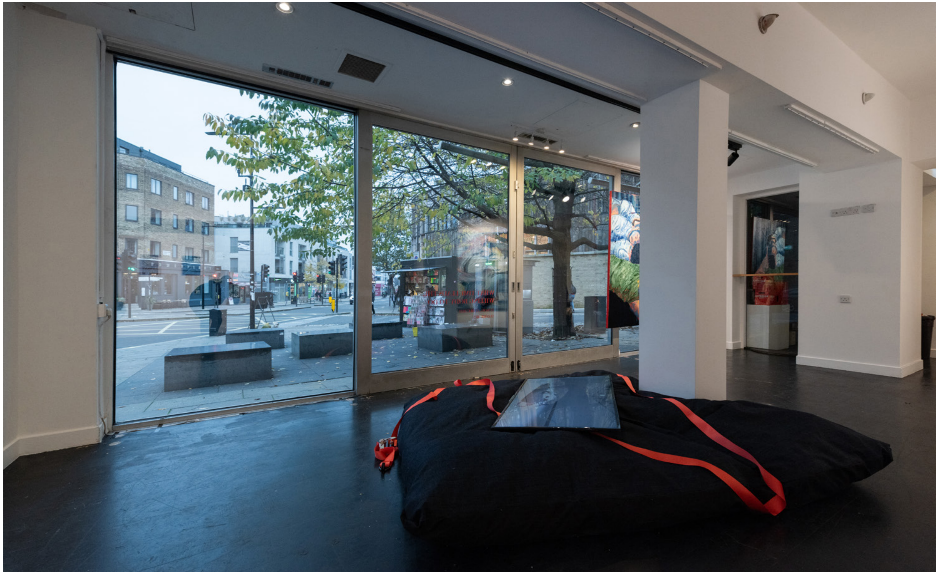
What Time Leads The Willing Body To Do. 2023 View of the exhibition, 2023, at The Koppel Project, London.