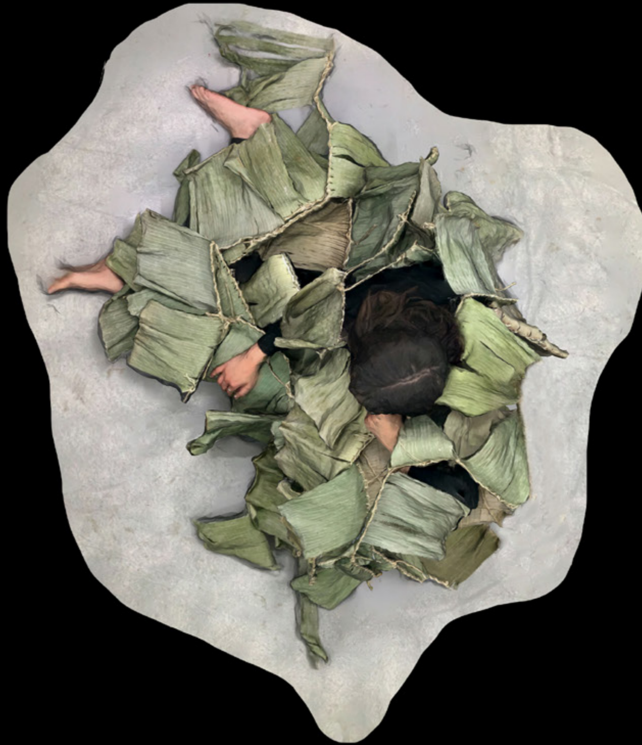
Citizen of a Nation Swallowed by The Sea. 2023 Video 1 min. 59 sec. Work awarded the LVMH Maison/0 The Earth Award 2023